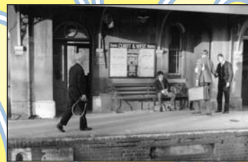
Alresford station in 1967