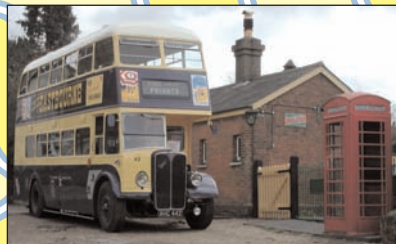
Please note, Buses may differ from that shown

Try our 'NEWSPAPER HEADLINE' COMPETITION Visit each station to capture the clues and complete the quiz! - Great prizes to be won!